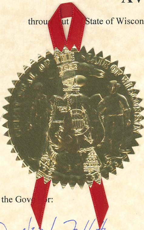
TONY EVERS GOVERNOR

IN TESTIMONY WHEREOF, I have hereunto set my hand and caused the Great Seal of the State of Wisconsin to be affixed. Done at the Capitol in the City of Madison this 10 th day of July 2019.